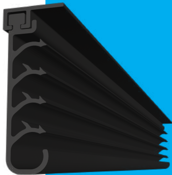
horizontal CNT ANTI-SPRAY SIDE BARRIER